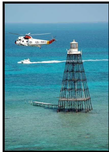
Sand Key Lighthouse