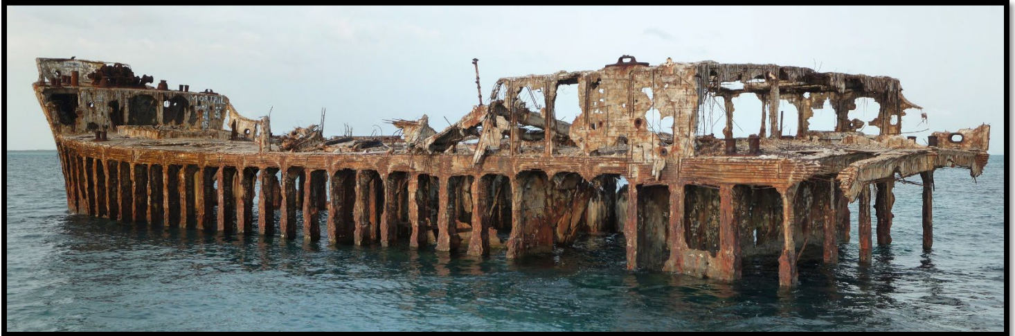
The SS Sapona

54.4 Miles to SS Sapona Bimini's Concrete Ship - SS Sapona Keep PORT of 25°39'2"N 79°17'36"W giving .25-mile buffer.